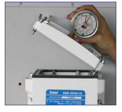
Step 7 Fit lid checking for correct positioning. Fit lid checking for correct positioning. Evenly tighten in the sequence shown.